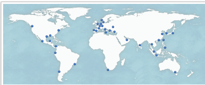
6 continents, 30+ countries, 50+ partners, 120+ trainers

Also, as ECDIS is a total change from paper charts, the master, officers and other watch keeping bridge officers should as a minimum undertake generic training, followed by a JRC type specific (familiarization) training.